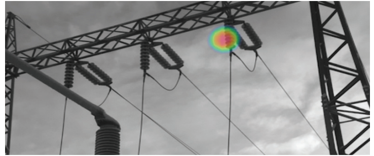
Example of Si124 PD severity assessment